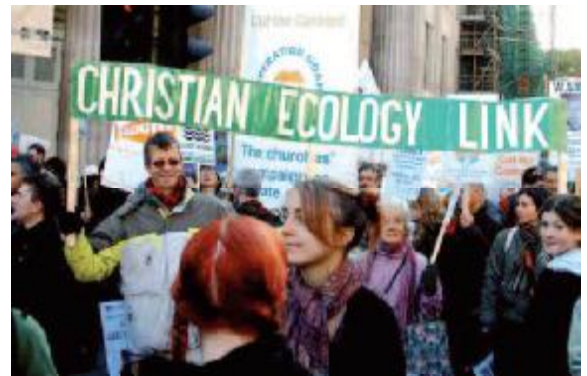
CEL at international day of climate action.

'Sufficiency' is the norm for our Christian living. When our true heart's desire is revealed through discipleship with Christ, we can make amends, voluntarily letting go of our wealth and connecting with the suffering of peoples, species and lands. When we live justly and within the limits of Creation we make peace with the Earth and enable Creation to flourish.